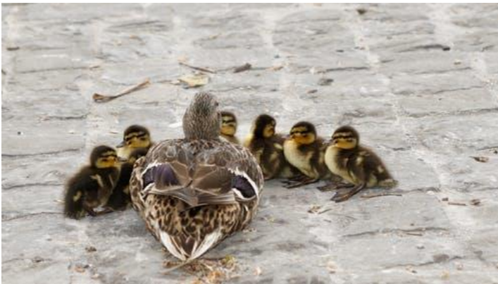
Image: Waterfowl_mallard-young-young-duck