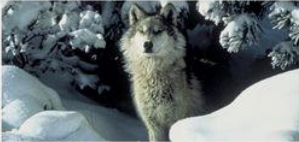
Gray wolf